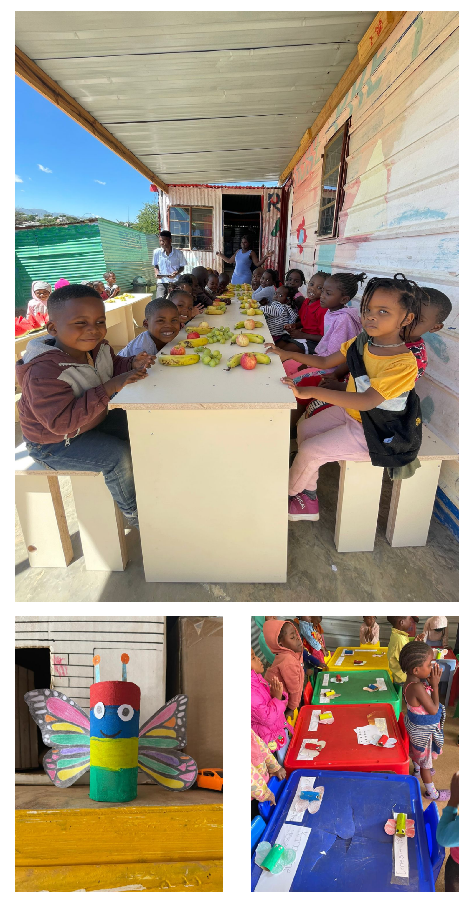
Project - Rose Day Care

Gigantic thank you to the Wood Connection for their superb craft and creating very needed tables and chairs for our little ones here at Rose School.